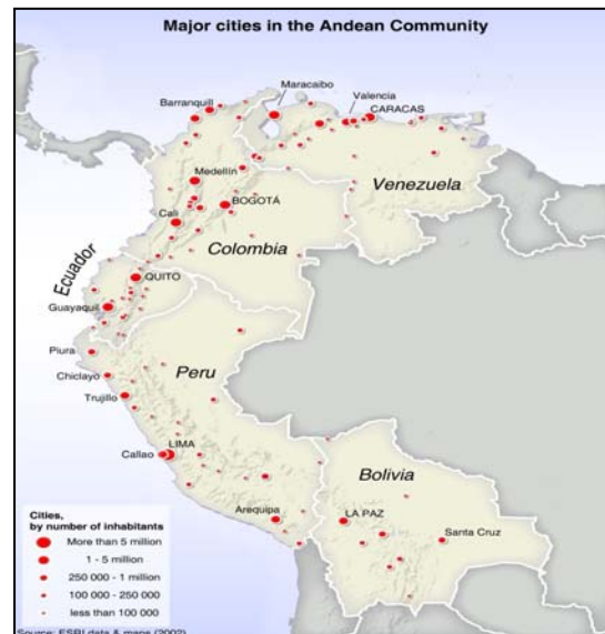
Map 2: Cities in the Andean region.

Mexico, Brazil and Argentina are part of the Group of 20 (G20) , signifying the relevance of the region for the global economy. However, while several countries such as Colombia are middle-income countries with comparatively good macroeconomic indicators, income distribution is highly unequal (Godnick et al. 2008). Additionally, access to natural resources – land, but also non-renewable resources such as fossil fuels – is politicised and concentrated among elites, which has led to social conflict in the past (Ibid.). The global