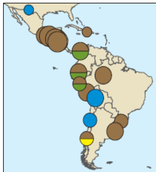
Map 1: Incidences of Environmental Conflict.

allocation of natural resources, wealth sharing, and indigenous rights fuelled turmoil in several countries such as Bolivia, Colombia and Chile. In the case of Bolivia, several provinces held (illegal) autonomy